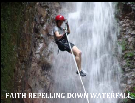
FAITH REPELLING DOWN WATERFALL