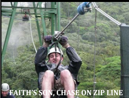
FAITH'S SON, CHASE ON ZIP LINE