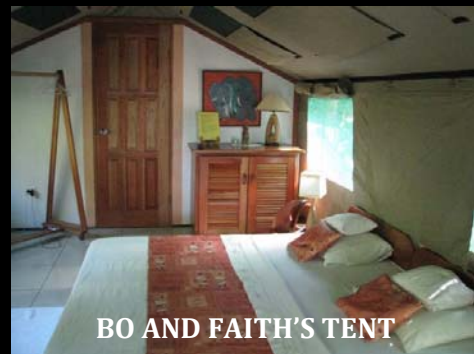
BO AND FAITH'S TENT