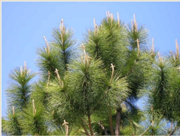
This pine tree crosses for Easter story was written by unknown author.