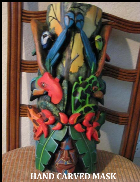
HAND CARVED MASK

Our last stop before heading home was at an Indigenous Indian village (Boruca Indians). We traveled for miles up into the mountains on dirt roads to visit their village and their workshop where they carve mask out of wood and sell them. The Boruca do not get money from the government because they have different beliefs. The money they make from the mask goes to their tribe. It was very eye opening to see how simple they live and how they work. If you want to go somewhere for an adventure, this is the place to go. As you can probably tell, I loved Costa Rica! It was everything I had hoped it would be and more.