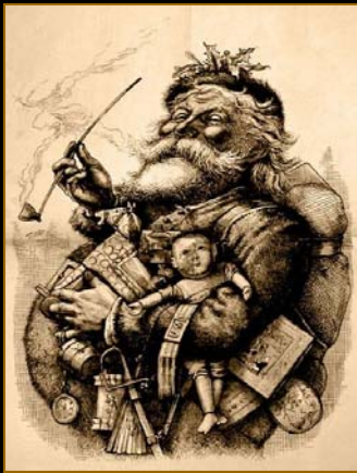
1881 illustration by Thomas Nast who, with Clement Clarke Moore, helped to create the modern image of Santa Claus.

MINUTES OF GENERAL MEMBERSHIP MEETING FOR OCTOBER...PAGE 8